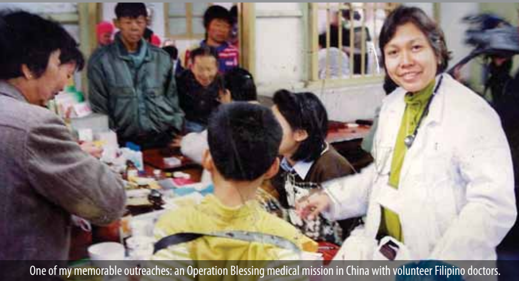
One of my memorable outreaches: an Operation Blessing medical mission in China with volunteer Filipino doctors.